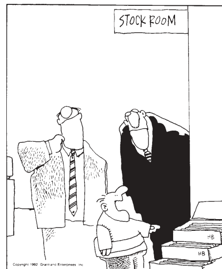
"GEE, MY DADDY HAS BOXES OF THESE SAME PENCILS AT HOME."